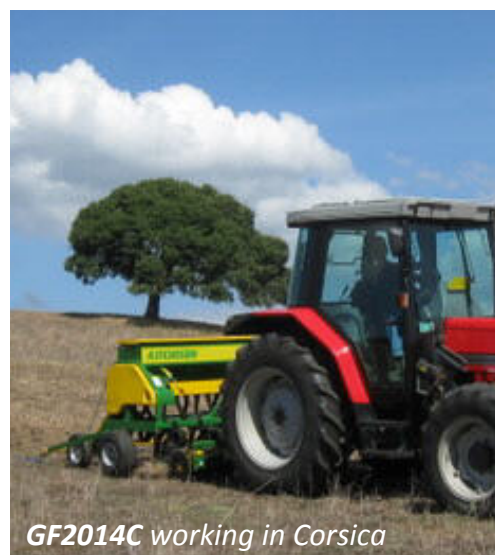
GF2014C working in Corsica

The GrassFarmer drills are compact and lightweight, and have low horsepower requirement. A row of discs slice open the sward in advance of the Aitchison boots mounted on three staggered rows of spring-tines. There is an optional chain covering harrow which may be fitted at the rear to produce a better finish at little additional cost. The Aitchison hopper with sponge seed-metering system enables all grass and leguminous mixtures to be sown as well as more complex arable silage and game cover crops. Clovers can also be sown at very low seed rates (under 2kgs/ha) for those seeking to adjust the clover content of an existing pasture.