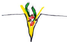
The V-slot made by a conventional disc drill

Grazed grass is the best and cheapest forage a livestock farmer can produce. With this in mind, the Aitchison slot-seeding system was developed in New Zealand in the early 1970's. Aitchison GrassFarmer drills are purpose-built for the renewal and above all the rejuvenation of pasture-land without resorting to ploughing and with a minimum of chemical and fertiliser use.