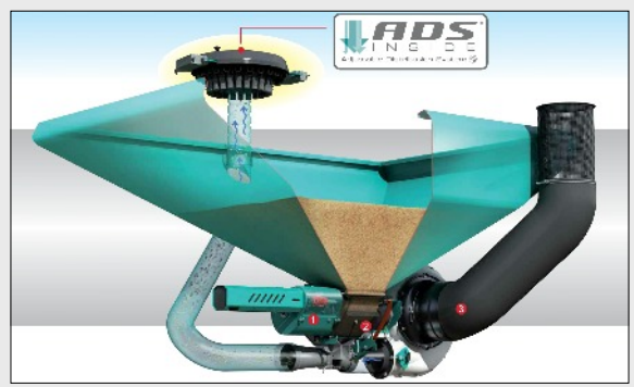
ADS seed metering and delivery. Hopper capacities range from 1000 litres to 4000 litres depending on the model.